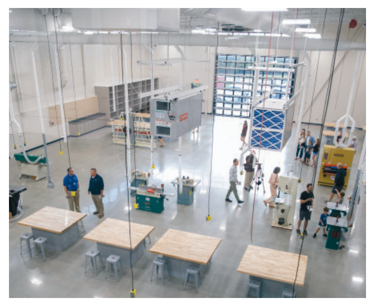
Ceremony guests tour the Construction Science suite

enthusiastic. He plans to take full advantage of the opportunities the center provides, having enrolled in both agricultural welding and drafting/computer-aided drawing this past semester. He aspires to be an architect, and knows the skills he learns in high school will help him on that journey. "The Innovation Center offers better equipment,