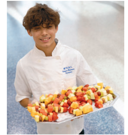
A culinary student serves ceremony guests

has granted me the opportunity to explore my passion for working in a lab," she shared. "The level of opportunity, learning, and growth facilitated here wouldn't be possible without this building. I'm grateful for the investment in our future and for the opportunity to learn in this environment."