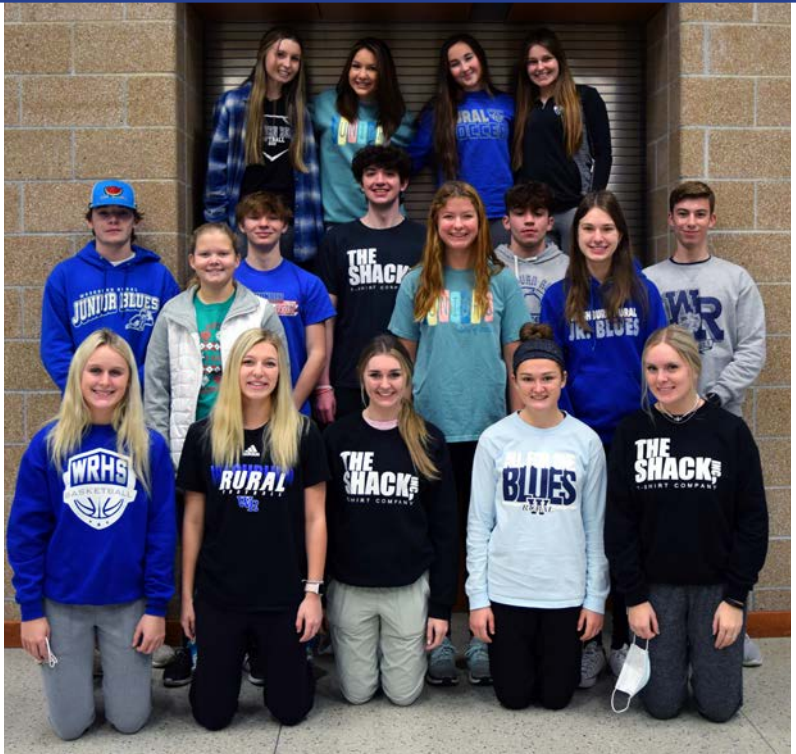
2020-2021 Shack Staff