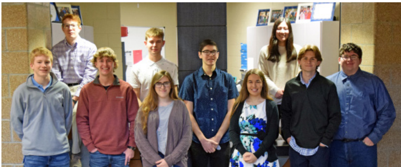
2020-2021 WRHS Bank Staff