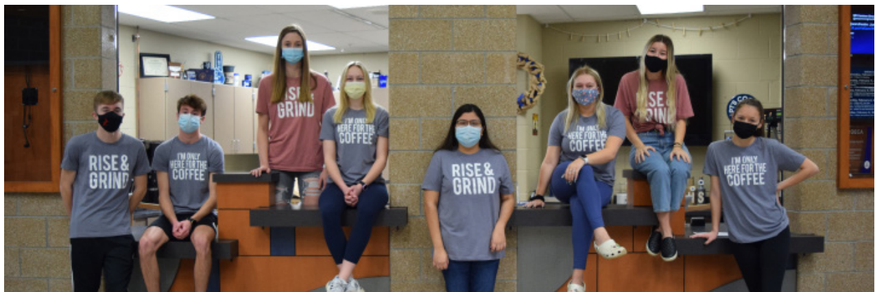
2020-2021 The Common Grounds Staff

This is the sixth year that DECA, WRHS business club, and the student-businesses have teamed up. DECA prepares emerging leaders and entrepreneurs for careers in marketing, finance, hospitality and management in high schools and colleges around the globe. Members can become: academically prepared for college and careers in marketing, finance, hospitality or management, community oriented by gaining an appreciation for the benefits of service and their potential impact on the community and world professionally responsible with ethics, integrity and high standards experienced leaders by practicing key leadership skills such as goal setting, consensus building and project management. The project, School Based Enterprise Program, is a chapter project that develops business and marketing knowledge and skills. The School Based Enterprsie Program applies entrepreneurial knowledge and skills to a single sales/service activity to be run as a real business venture. In a sense, the project is a chapter entrepreneurship project.