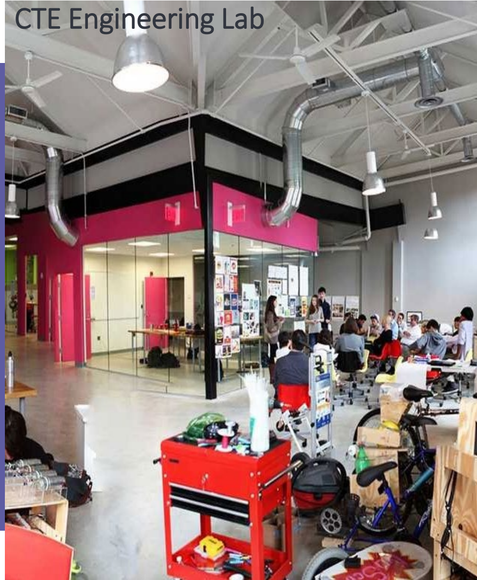
CTE Engineering Lab