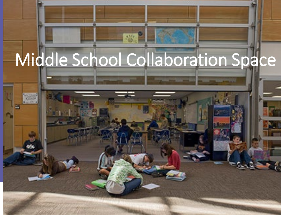
Middle School Collaboration Space